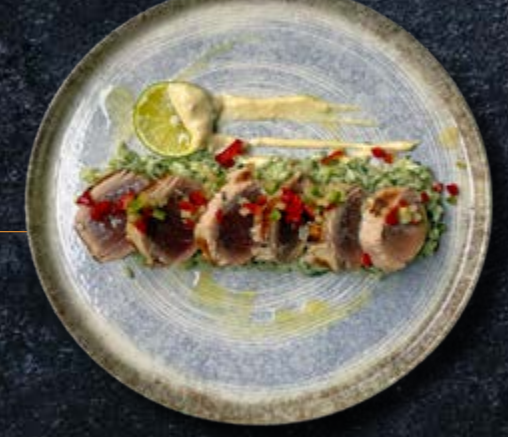
TUNA STEAK with mix of salads, nuts and appl