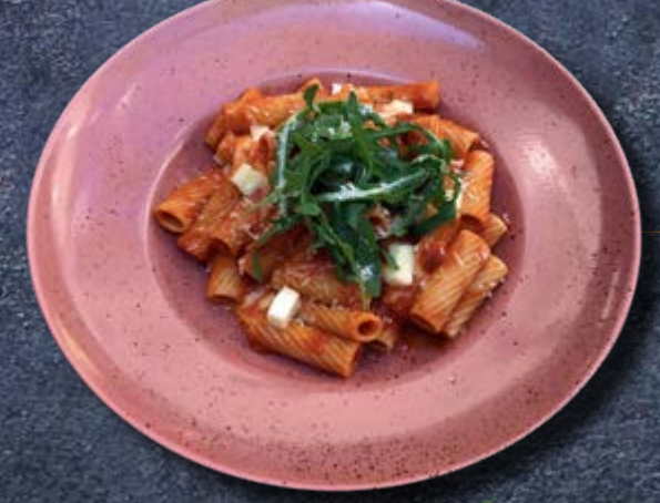
RIGATONI BISTECCA beef, olives, sun-dried tomatoes, peperoncino, tomatoes, mozzarella