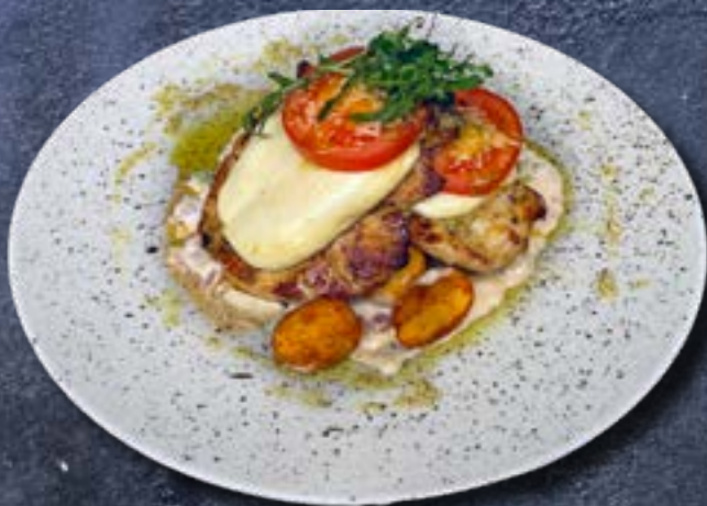
CAPRESE TURKEY turkey fillet, mozzarella, tomato, with zucchini and prosciutto sauce