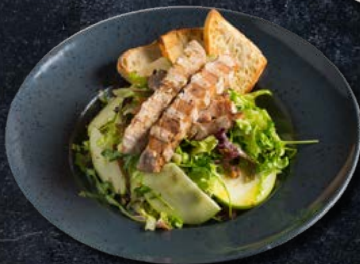
TUNA SALAD salad with fresh tuna, salad mix, walnuts, sour apple and dressing