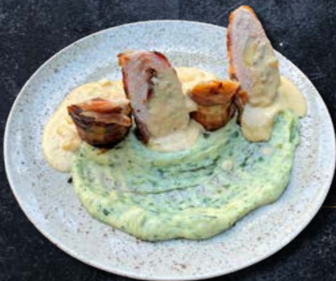
TURKEY ROLLS rolled turkey with walnuts and sun-dried tomatoes, bacon, mashed potatoes with chard and smoked cheese sauce