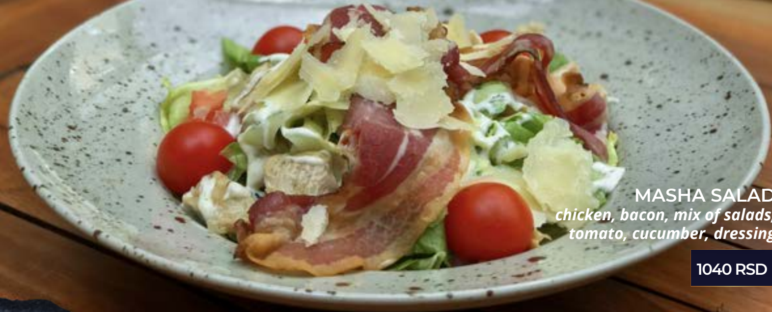
MASHA SALAD chicken, bacon, mix of salads, tomato, cucumber, dressing