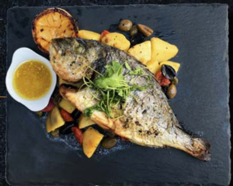
SMOKED TROUT FILLETS with potatoes and chard