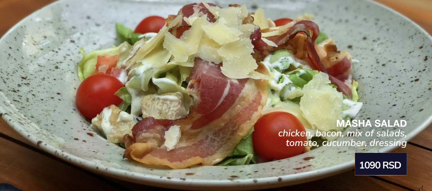
MASHA SALAD chicken, bacon, mix of salads, tomato, cucumber, dressing