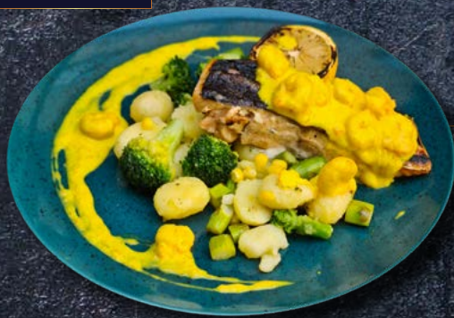
TUNA TATAKI blue roasted tuna, risotto with chard and salsa with lime