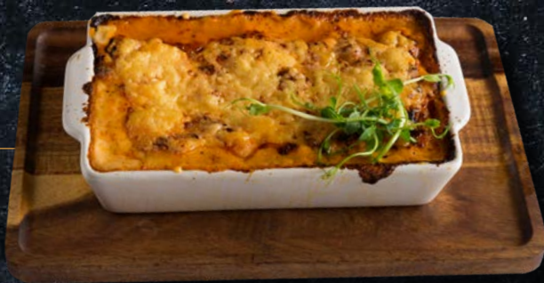
RISOTTO WITH CHICKEN with parmesan and mushrooms