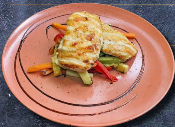
AROMATIZED CHICKEN NEW chicken in pumpkin sauce with potatoes