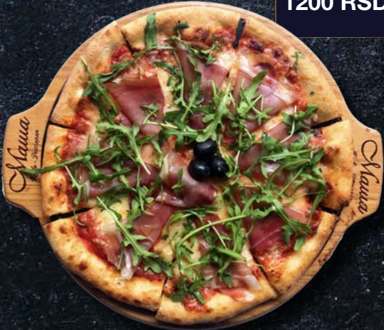
SICILIANA goat cheese, pancetta, cherries, rocket, quail eggs, olives