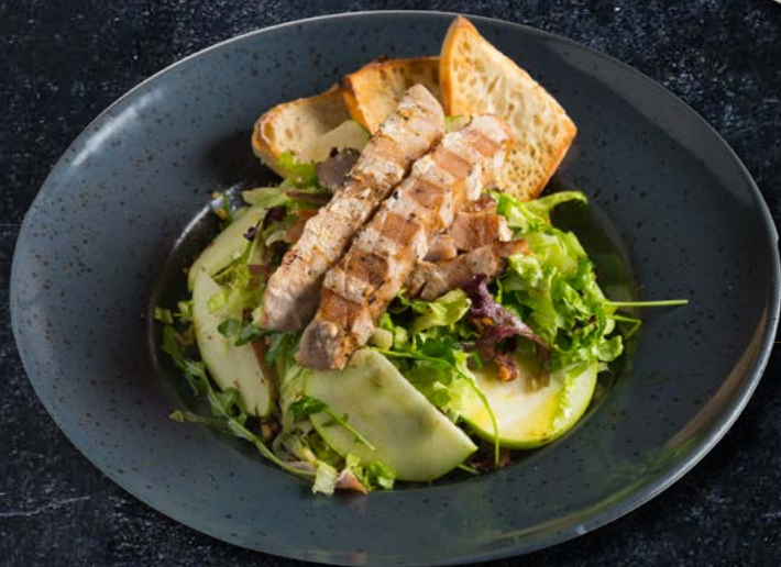
TUNA SALAD salad with fresh tuna, salad mix, walnuts, sour apple and dressing