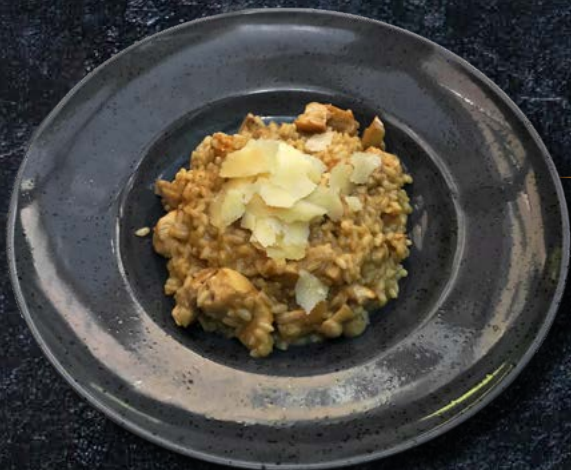
BREADED PRAWN RISOTTO NEW saffron, sun-dried tomatoes and corn