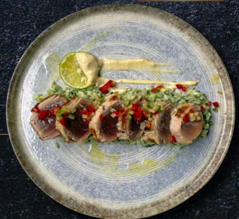
TUNA STEAK with mix of salads, nuts and appl