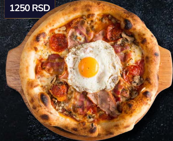
NEW VOJVODJANKA smoked pork loin, bacon, kulen sausage, egg, cheese and tomato sauce