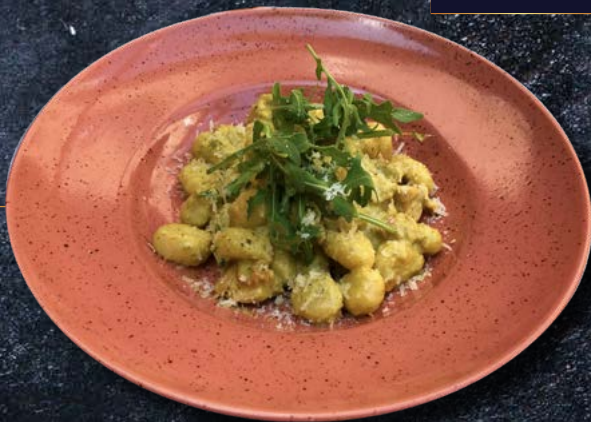
GNOCCHI WITH TURKEY AND PROSCIUTTO