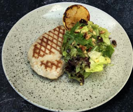
SEA BREAM ON THE GRILL with potatoes, cherry tomatoes, olives, caper