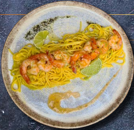
GRILLED SALMON IN PASSIONATE SAUCE with mashed potatoes and flavored vegetables