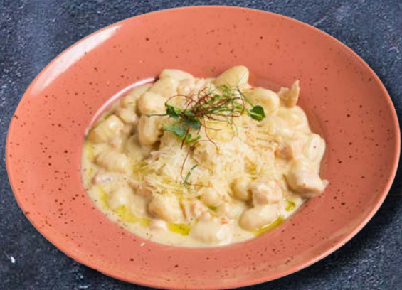
GNOCHI QUATTRO FORMAGGI WITH CHICKEN