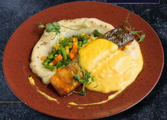
PORTUGUESE SALMON salmon fillet, broccoli, new potatoes, corn, sauce with shrimps and saffron