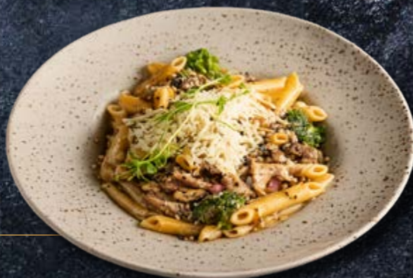
RIGATONI BISTECCA NEW beef steak, mixed mushrooms, broccoli, red onion and roasted sesame seeds