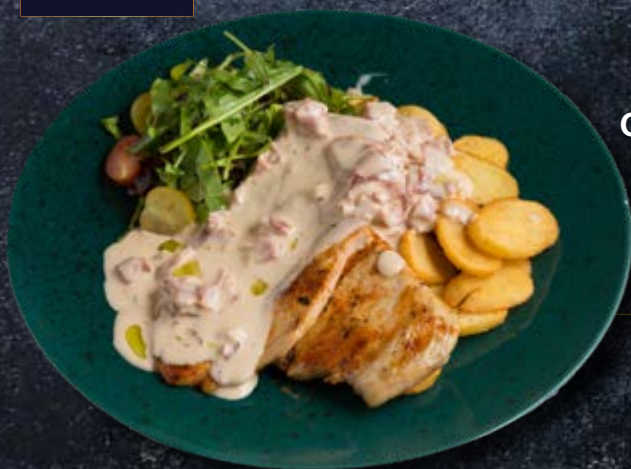
CHICKEN IN A SAUCE OF YOUR CHOICE chicken fillet with potatoes and a mix of green salads options: 1. sauce of four types of cheese, 2. mushroom sauce, 3. prosciutto sauce