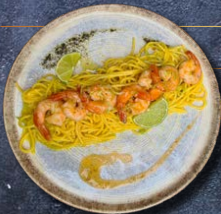
GRILLED SALMON IN PASSIONATE SAUCE with mashed potatoes and flavored vegetables