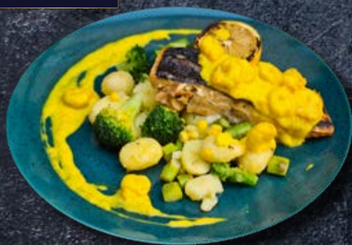
TUNA TATAKI blue roasted tuna, risotto with chard and salsa with lime