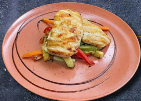
AROMATIZED CHICKEN NEW chicken in pumpkin sauce with potatoes