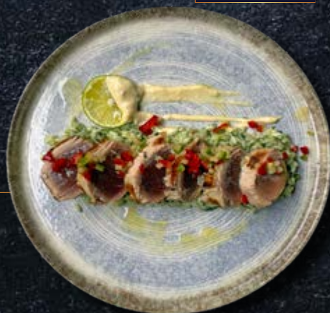
TUNA STEAK with mix of salads, nuts and appl