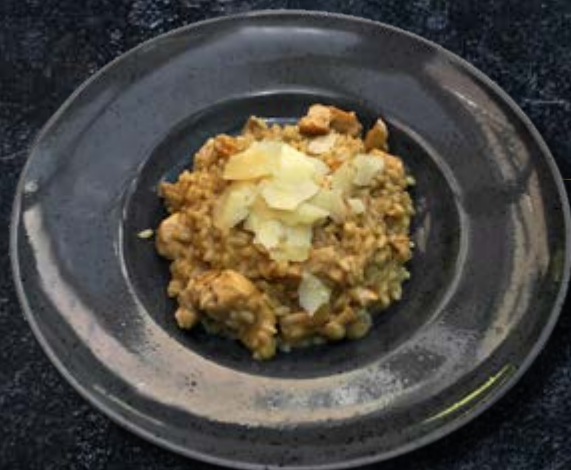
BREADED PRAWN RISOTTO NEW saffron, sun-dried tomatoes and corn