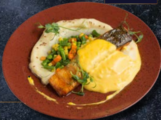
PORTUGUESE SALMON salmon fillet, broccoli, new potatoes, corn, sauce with shrimps and saffron