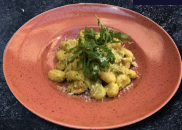
GNOCCHI WITH TURKEY AND PROSCIUTTO