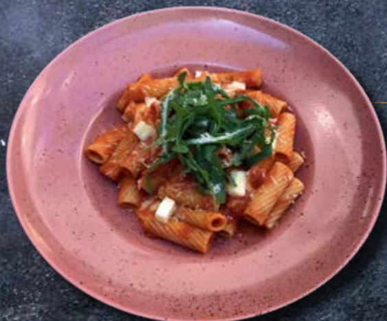
RIGATONI POMODORO tomatoes, mozzarella, basil, garlic i parmesan

The possibility of replacing the paste with a gluten-free one + 100 RSD