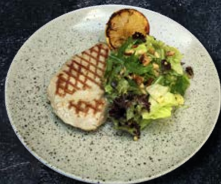
SEA BREAM ON THE GRILL with potatoes, cherry tomatoes, olives, caper