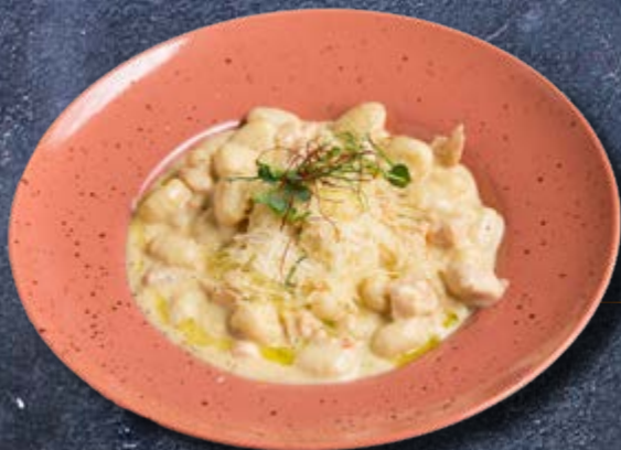
GNOCHI QUATTRO FORMAGGI WITH CHICKEN