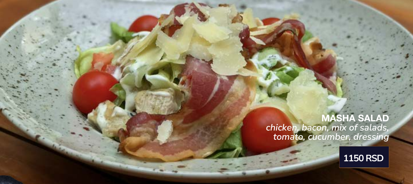
MASHA SALAD chicken, bacon, mix of salads, tomato, cucumber, dressing